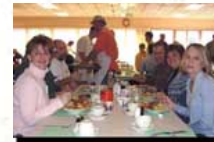
Sunday Breakfast 1st Sunday (Oct-Apr) Se-Wy-Co VFD