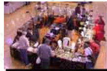
Gem & Mineral Show (In our 39th Year) Saucon Valley HS Gym