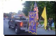
Community Events Community Days & Parades