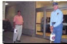
White Cane Days Bi Annual Collections 100% Go to Blind Projects