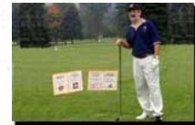
8th Golf Tournament SV / Hellertown Lions Late Summer