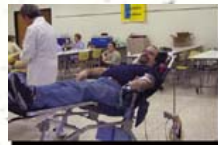
Blood Drives 3 Drives Annually Over 200 Pints Collected