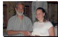
Local Scholarships 2 Annual Scholarships 1 Vo-Tec Scholarship